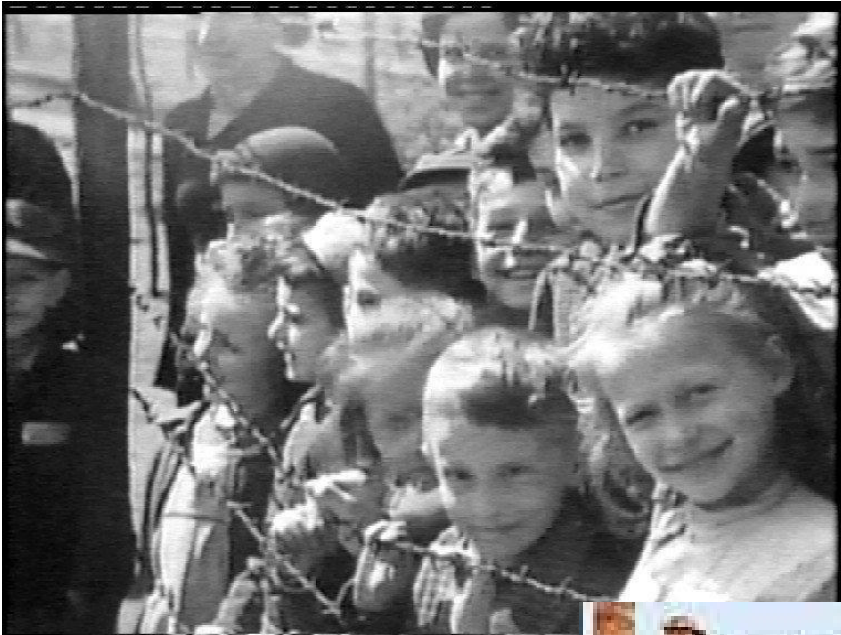
LEFT: Another picture of the children of the Bergen-Belsen camp (the little scamps again leaning on the camp's "electrified fence"), less often published than the one with Moishe's story.